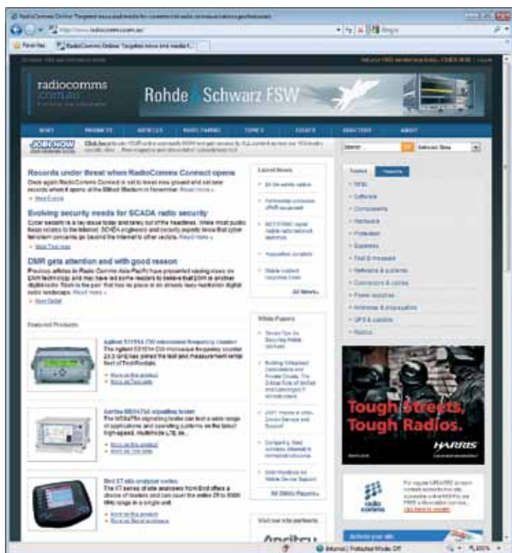
Source: Google Analytics avg/month

RadioComms.com.au is the site for radio communications professionals, focusing on technology, government, utilities, defence, emergency services and transport. It features in-depth, how-to content (new products, applications, technology advances, white papers & news). An eNewsletter service delivers site updates to members in an easy-to-read html format.*