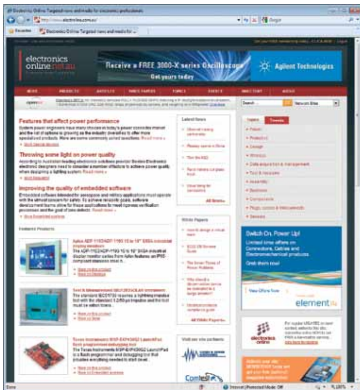
Source: Google Analytics avg/month

Electronicsonline.net.au is a vital information resource (new products, applications, white papers, technology advances & news) for electronics professionals in manufacturing, design and service. The target audience covers all industries using electronic products and technology, with key industry sectors being communications, industrial control, computers, whitegoods, general manufacturing, broadcasting and more. An eNewsletter service delivers site updates to members in an easy-to-read html format.*