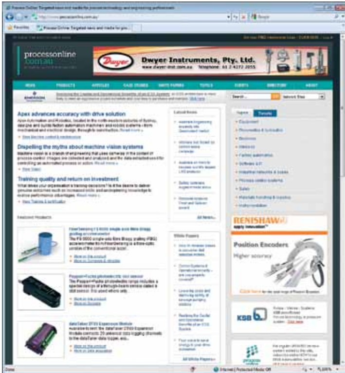
Source: Google Analytics avg/month

ProcessOnline.com.au delivers in-depth, how-to information (white papers, new products, applications, technology advances & news) for process control, automation and instrumentation engineers. An eNewsletter service delivers site updates to members in an easy-to-read html format.*